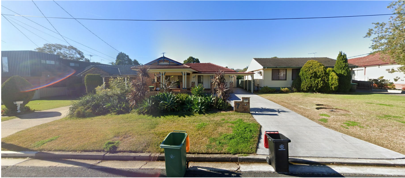
STREET VIEW OF SITE