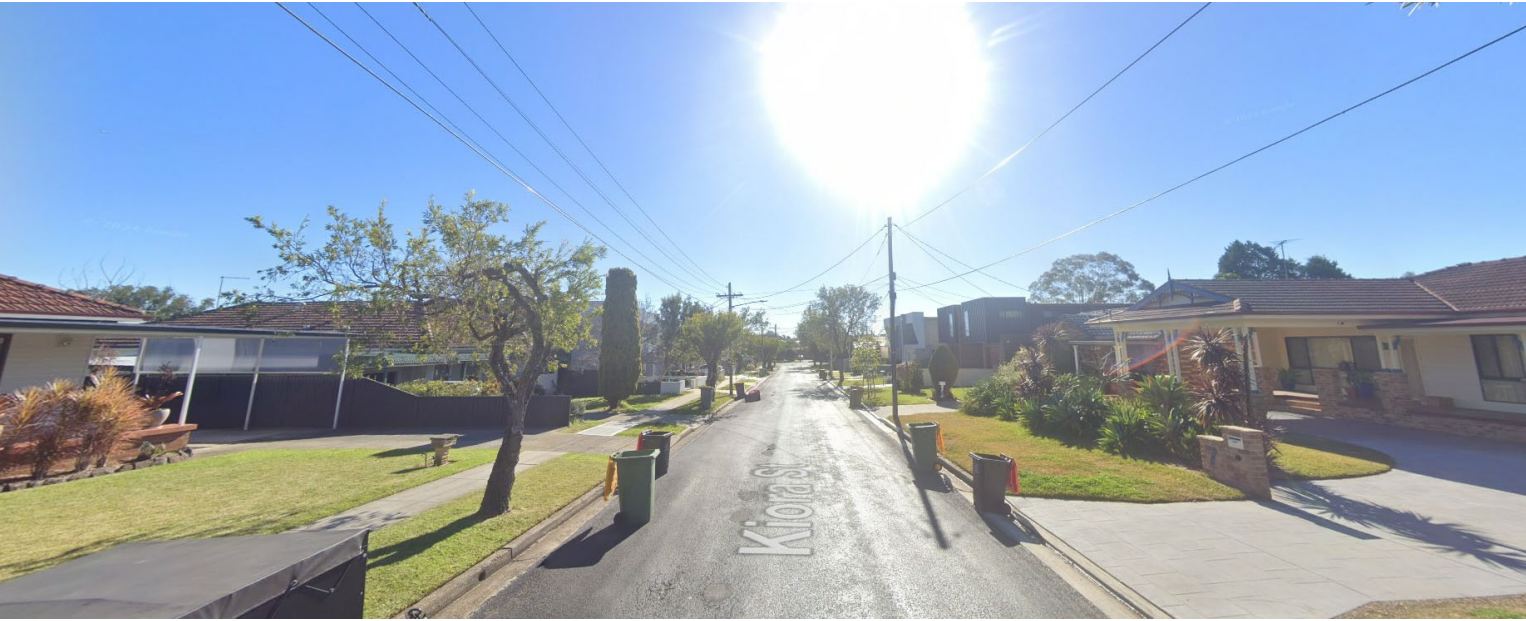
KIORA STREET LOOKING NORTH