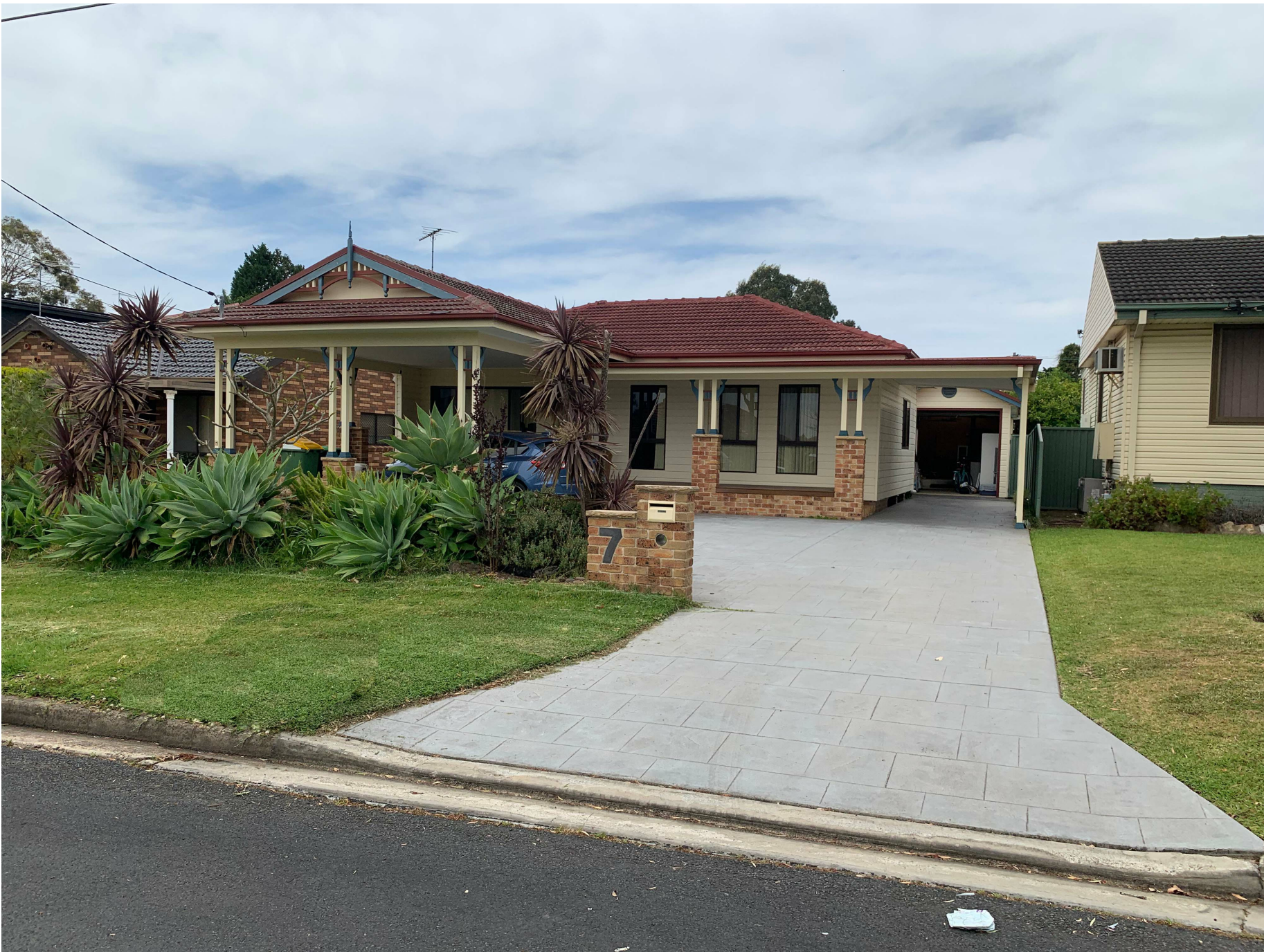
VIEW OF EXISTING DWELLING AND DETACHED GARAGE FROM STREET