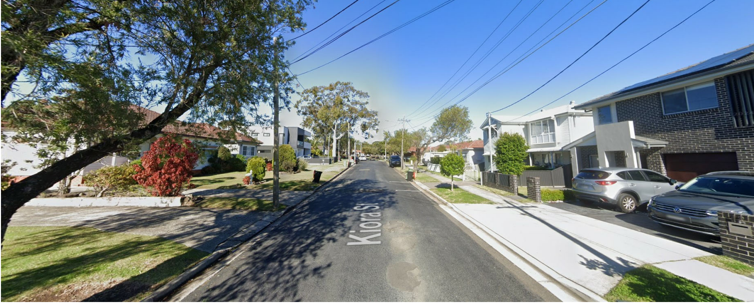
KIORA STREET LOOKING SOUTH