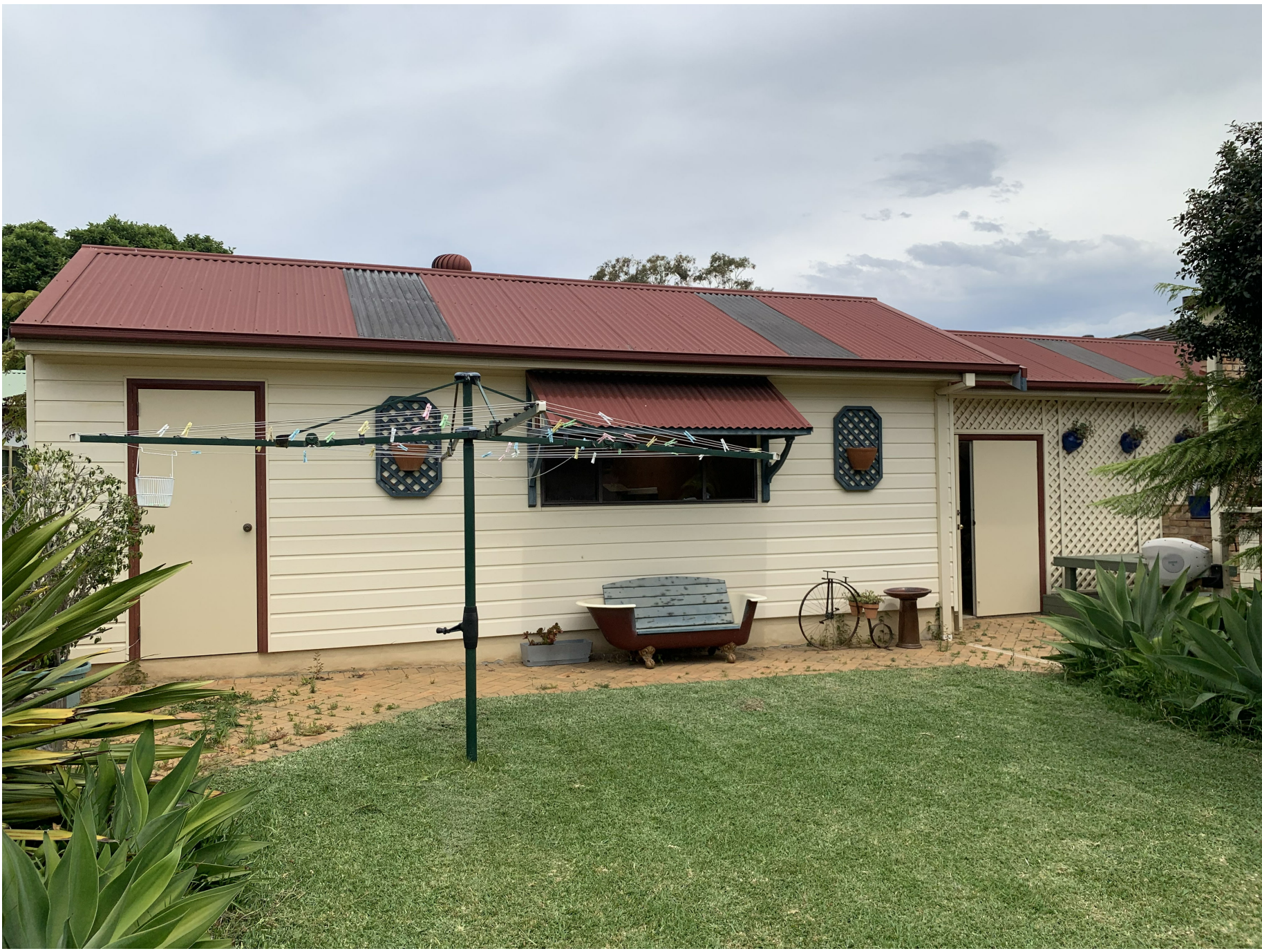
VIEW OF EXISTING DETACHED GARAGE PROPOSED TO BE CONVERTED INTO A SECONDARY DWELLING FROM REAR PRIVATE OPEN SPACE